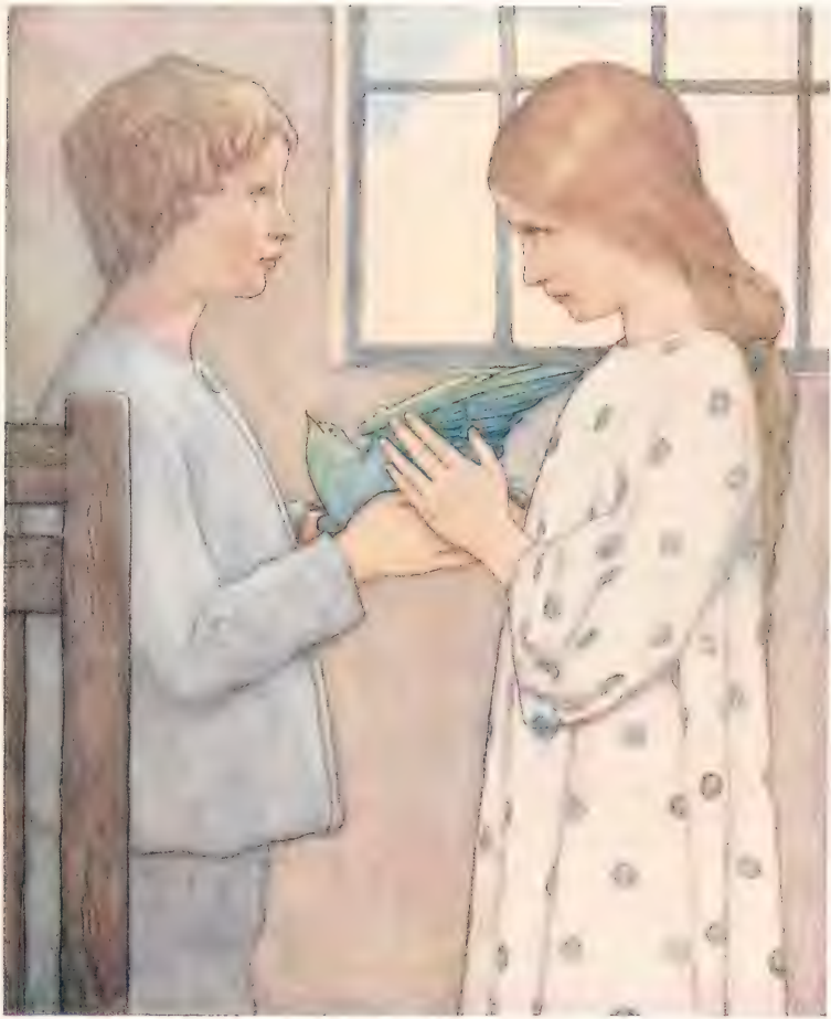
THE BIRD ABOUT TO FLY OFF FROM BETWEEN THE CHILDREN'S HANDS